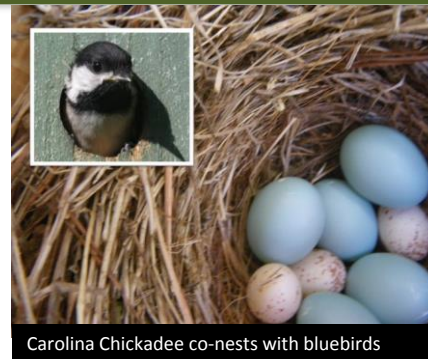
Carolina Chickadee co-nests with bluebirds