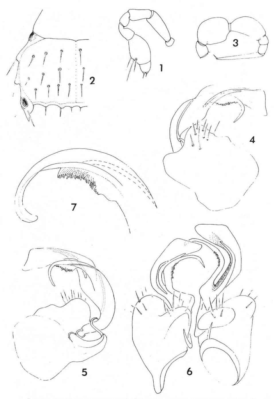
Figs. 1-7. Speodesmus aquiliensis male. Fig. 1. Right antenna, Anterior view. Fig. 2. Left half of midbody segment, dorsal view. Fig. 3. Leg from midbody segment, anterior view. Fig. 4. Right gonopod, lateral view. Fig. 5. Right gonopod, mesal view. Fig. 6. Gonopods, posterior view. Fig. 7. Solenomerite tip, lateral view.