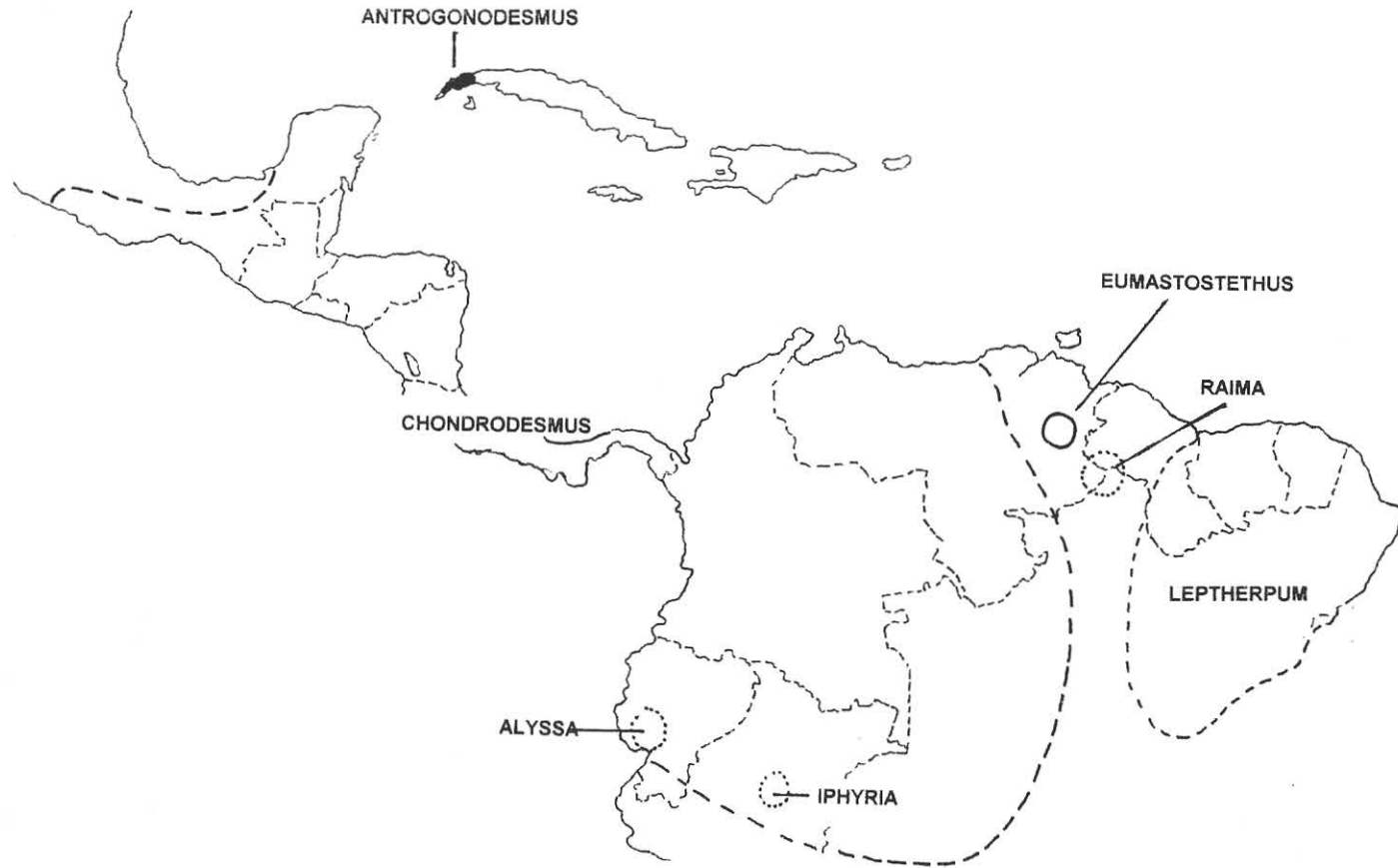
Fig. 9. Central America, the Greater Antilles, and northern South America, showing the approximate distribution of the seven genera of Chondrodesmini. The dashed line encloses the range of Chondrodesmus , to which the other genera are distinctly peripheral.