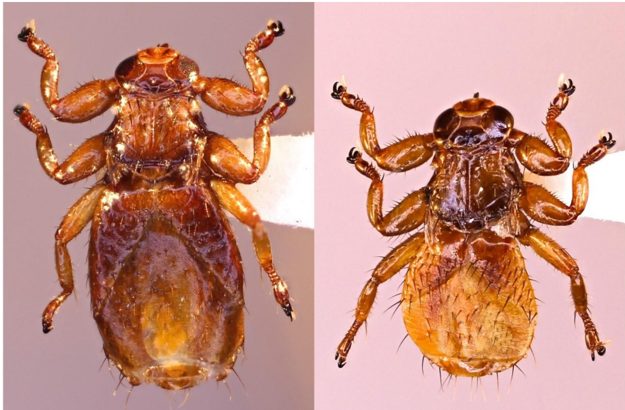
Fig. 1. Dorsal view of (left) dealate female Lipoptena mazamae (VMNH 110610) from Pittsylvania Co., Virginia; and (right) dealate male Lipoptena mazamae (VMNH 110619.1) from Henry Co., Virginia.

The male deer (NDM 4497) was collected on the morning of 9 October 2019, and the entire carcass was placed in a plastic bag within 12 hours of the animal's death. The carcass was brought to the Virginia Museum of Natural History and placed in a -20^{\circ}\text{C} freezer on the same day. On 19 November the carcass was thawed and the skin was removed as part of procedures to prepare the bones as a skeleton. During skinning, 82 deer keds (39 males, 43 females) were found, most of which were